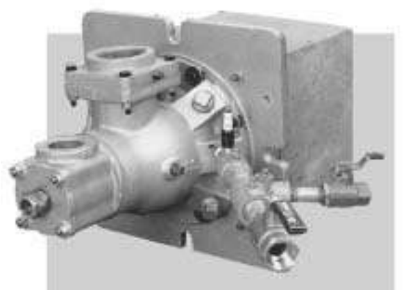
425 Burner with pilot set (ordered separately)

425- -MB Burners have a 13-1/2" "Milk Bottle" tile with reduced outlet; they produce higher velocity flames than the standard burner, also offer somewhat better protection for burner internals from furnace radiation. Good tile installation practice is important with any burner (see supplements DF-M1 and -M2). It is critical with Milk Bottle tiles because of higher pressures developed in